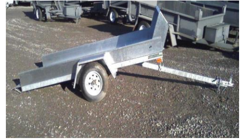
FB810S / FB812S